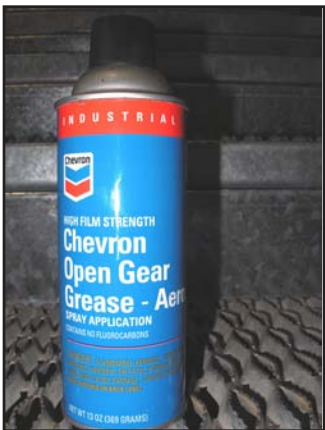
This product is an excellent replacement for Chevron Open Gear Grease